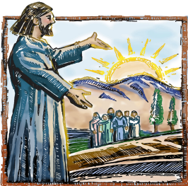
And he went throughout Galilee, proclaiming the message... MARK 1:39, NRSV